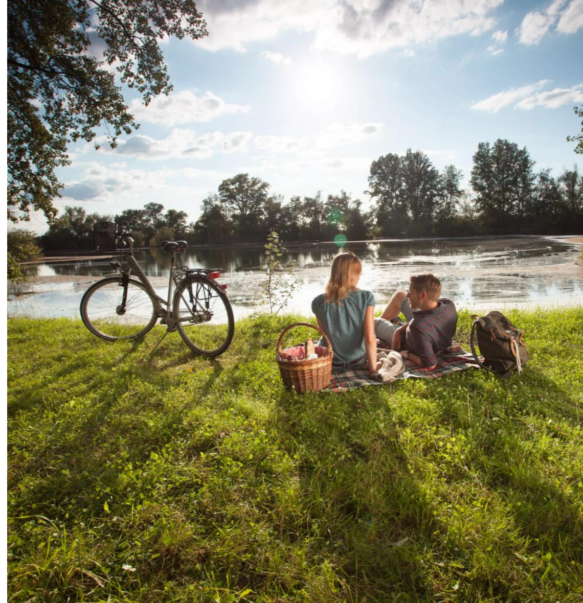
EuroVelo 15 in Germany