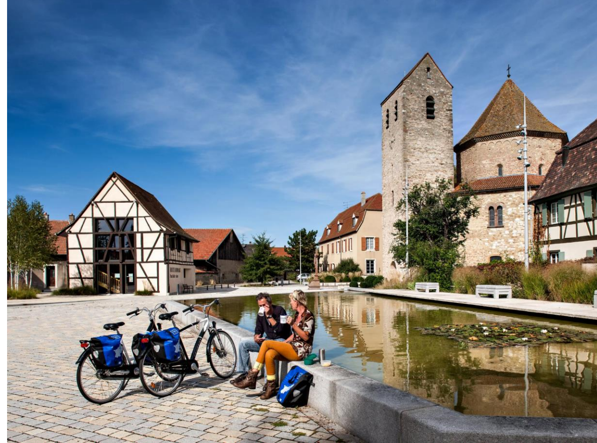
EuroVelo 15 in Alsace