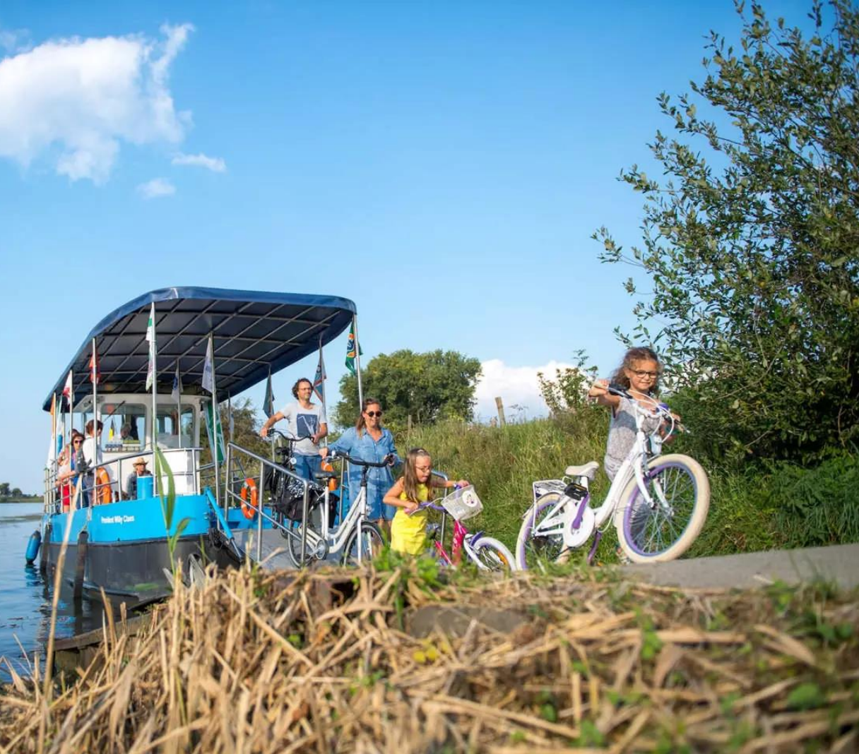
Take the ferry to cross the Meuse River on EuroVelo 19