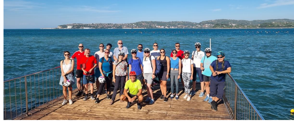
Second ICTr meeting in Portoroz, Slovenia, 26-27 September 2023