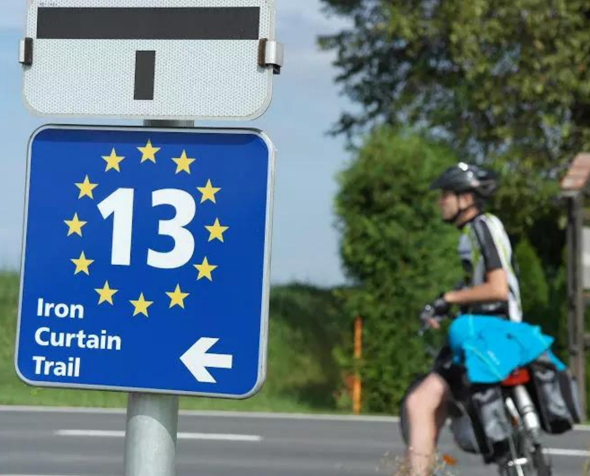
EuroVelo 13