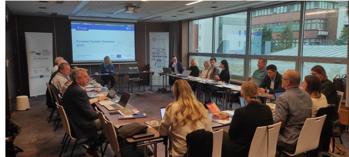
Kick-off meeting of BBU in Gdansk, Poland, 19-20 October 2023