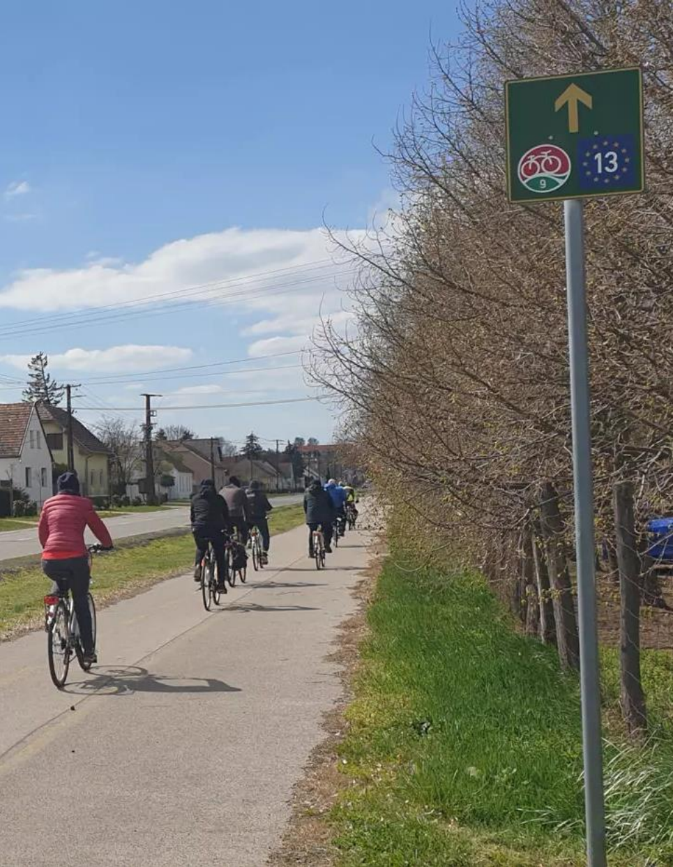
EuroVelo 13 in Hungary